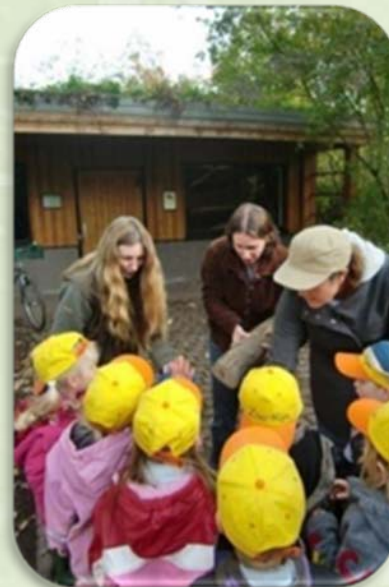
weekly zoo visits