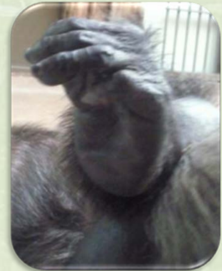
Give us a hand